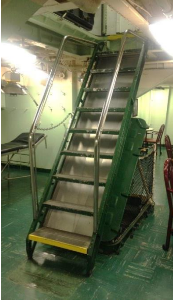
This is an example of stairways ("ladders") you will be using to reach your party room. All of our ladders are steep so please plan and pack accordingly!

Please be sure to remember to fill out our Roster and Group Waiver for your party ahead of time so that everyone can come aboard for your event!