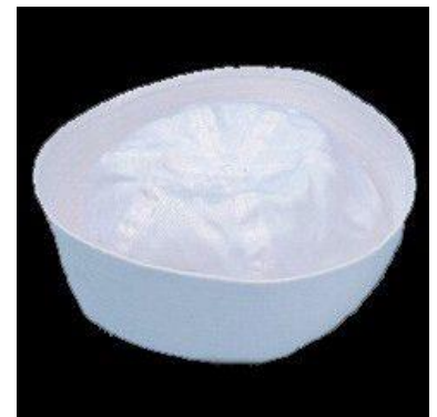
Sailor's Dixie Cup Hat