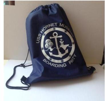
Our Boarding Party Drawstring Bag

Upon arriving at the museum you may be asked to watch our Orientation video which will go over the safety rules of the ship.